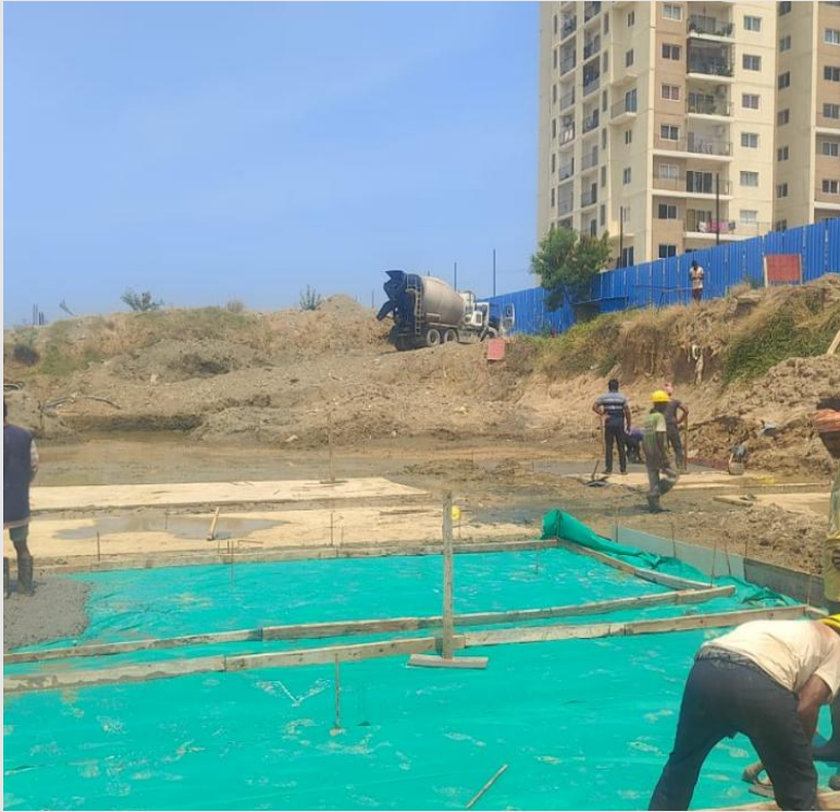
Footing PCC works in progress