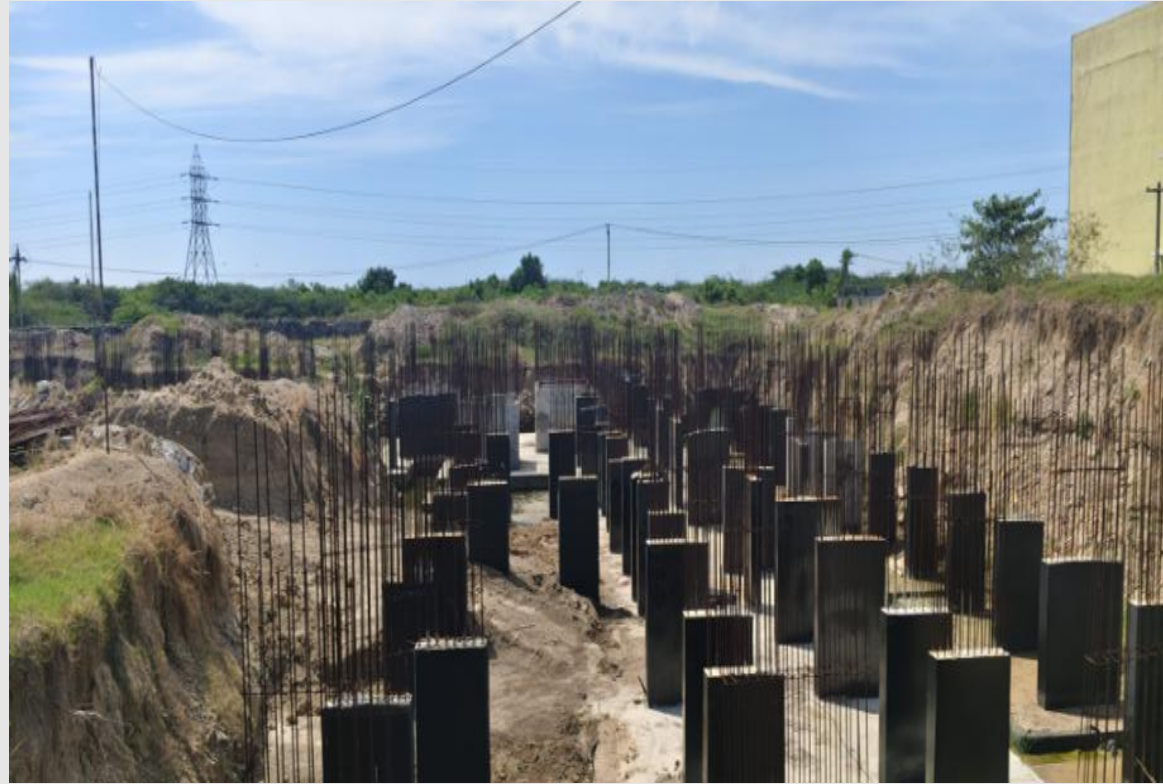
Sludge cleaning for waterproofing works in progress