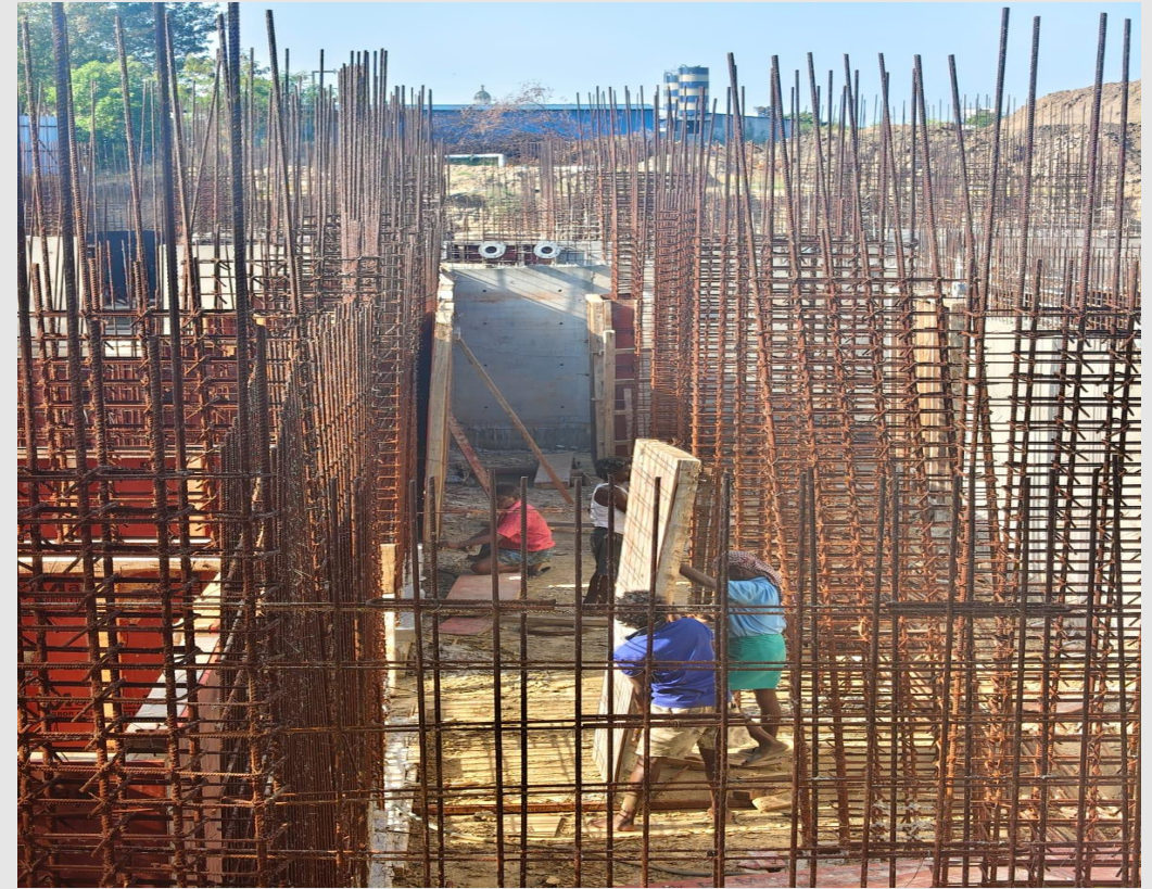
U G sump pump room shuttering works in progress