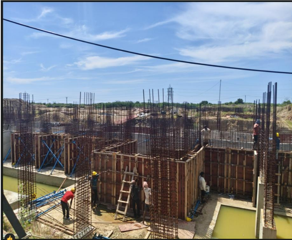
UG sump pump room & 13 nos column shuttering supporting and scaffolding works in progress