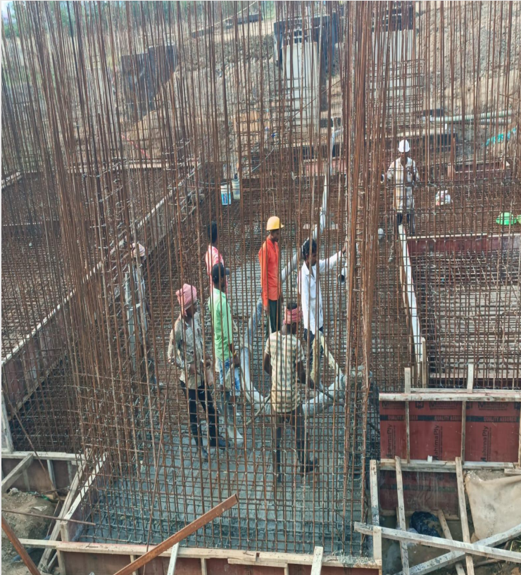
UG sump raft concrete work