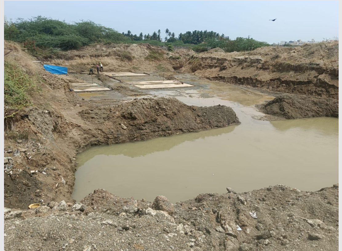
Slush Cleaning work in progress