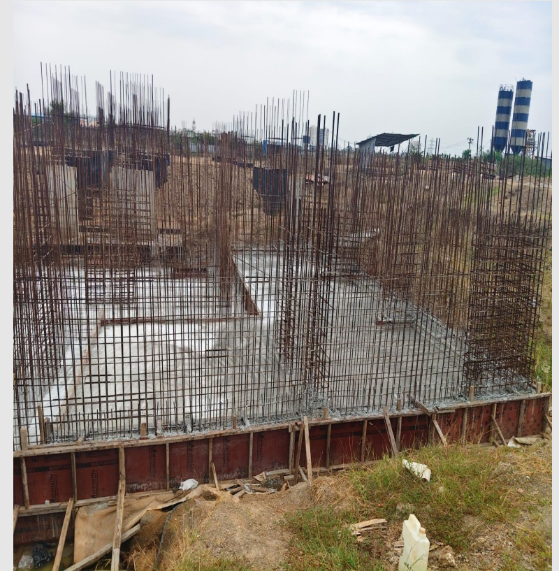
UG sump concreting work completed & Curing in progress