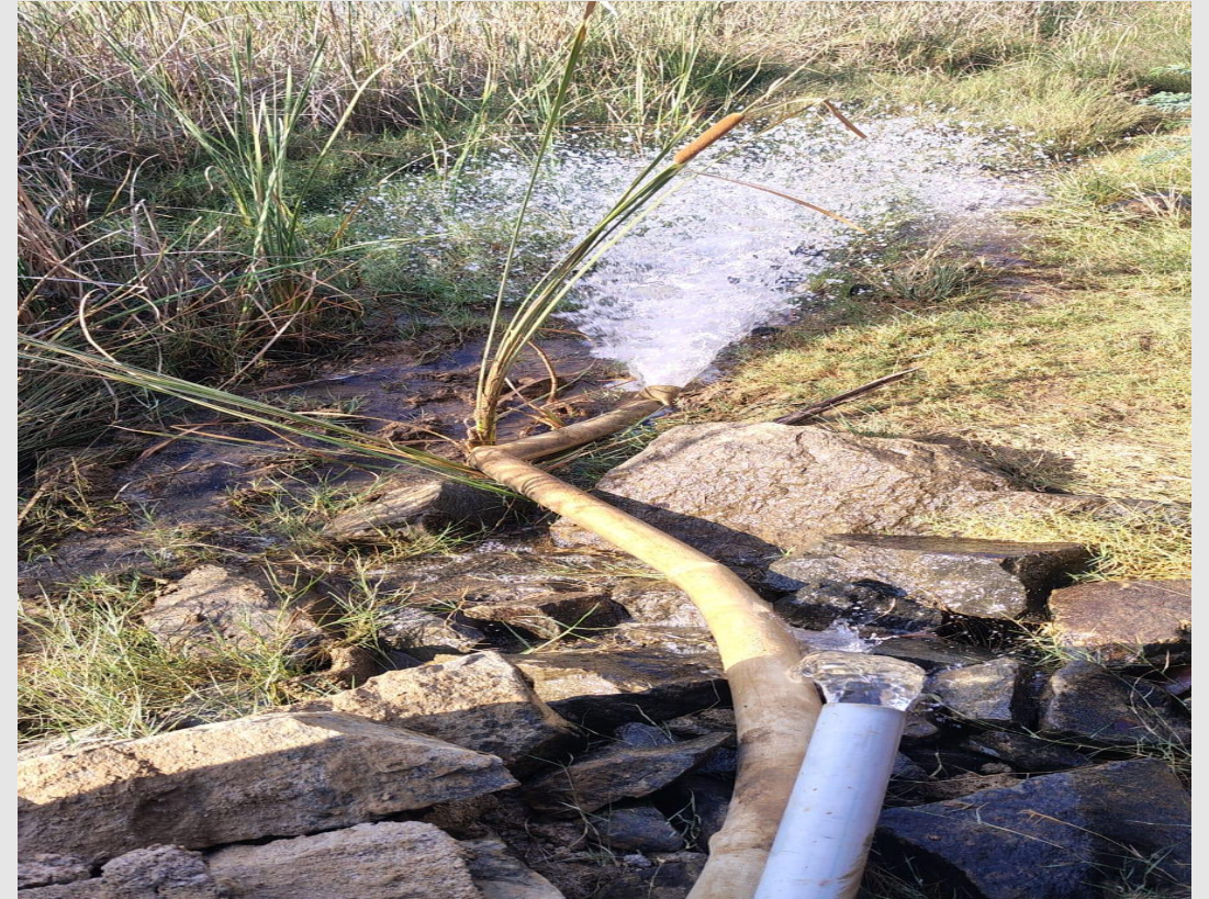
Dewatering work in progress