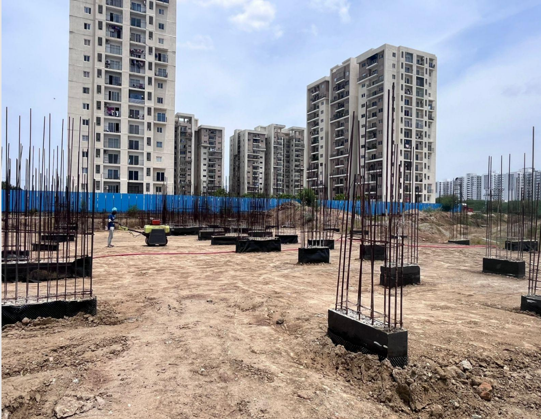
Soil backfilling & compaction work in progress