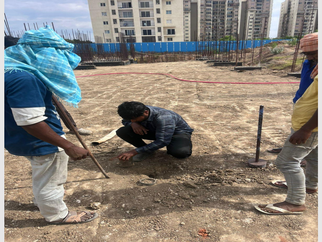
Soil test work in progress