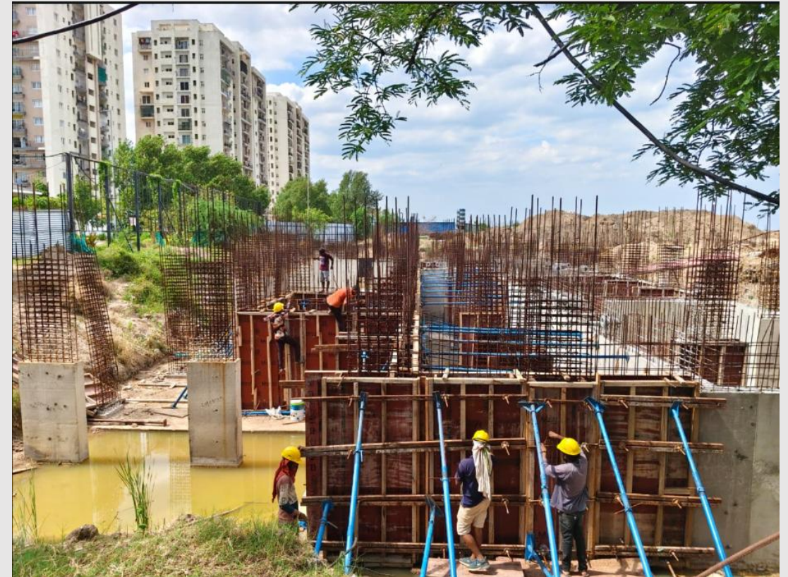
UG sump pump room and 13nos of column shuttering and supporting works in progress