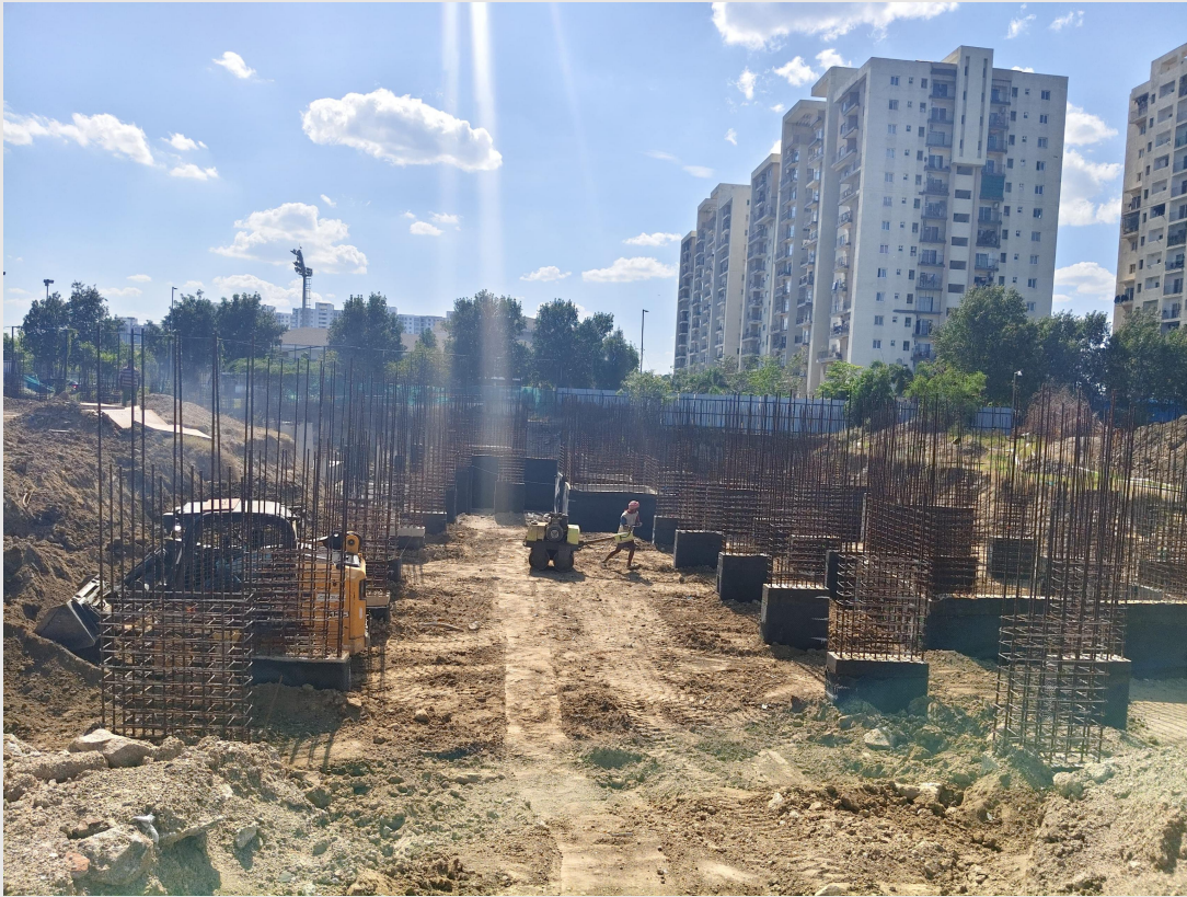
North side soil levelling and roller compaction works in progress